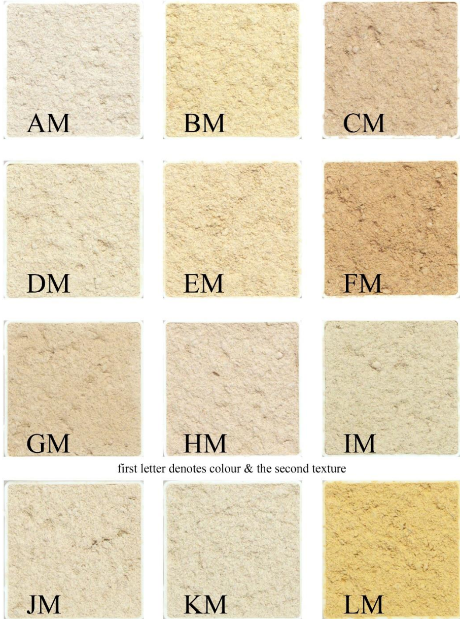
first letter denotes colour & the second texture

This is a general indication of colour. No warranty is given or implied that the goods will all respects be equal to these images. A site sample panel should always be built. 25 Kg bags of these colours are available.